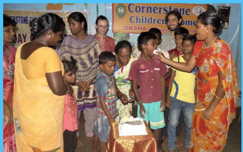
Birthday cake is shared during the monthly birthday celebration!