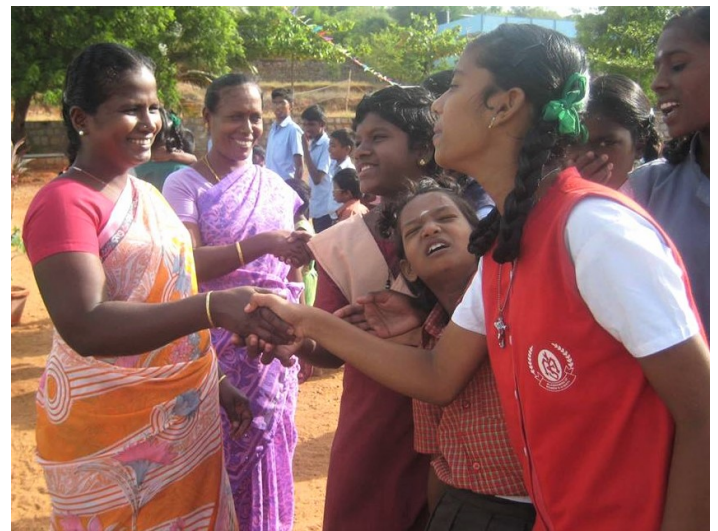
DKSHA children and staff happily interact during the Independence Day celebration!