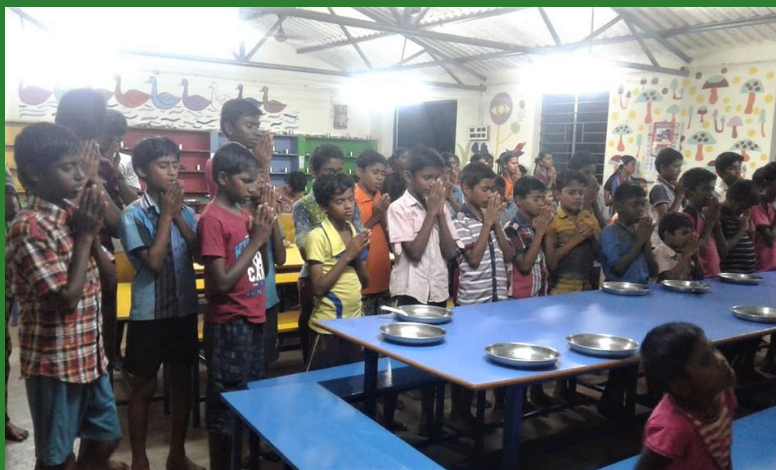
Children praying before their meal!