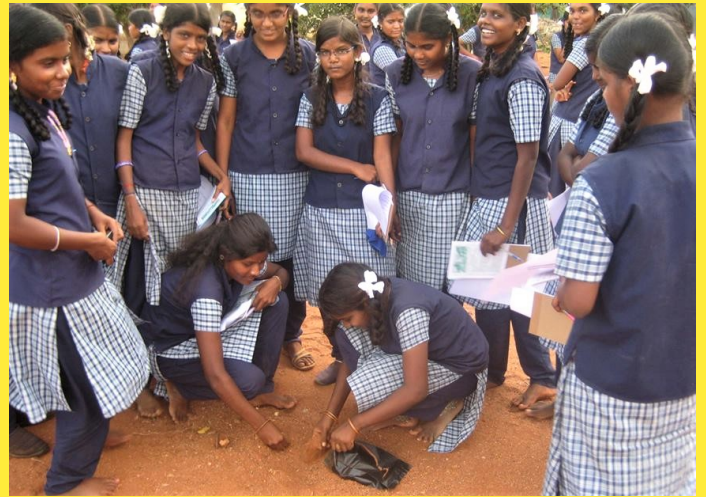
DKSHA hosts seminar on organic farming methods for over 200 students!