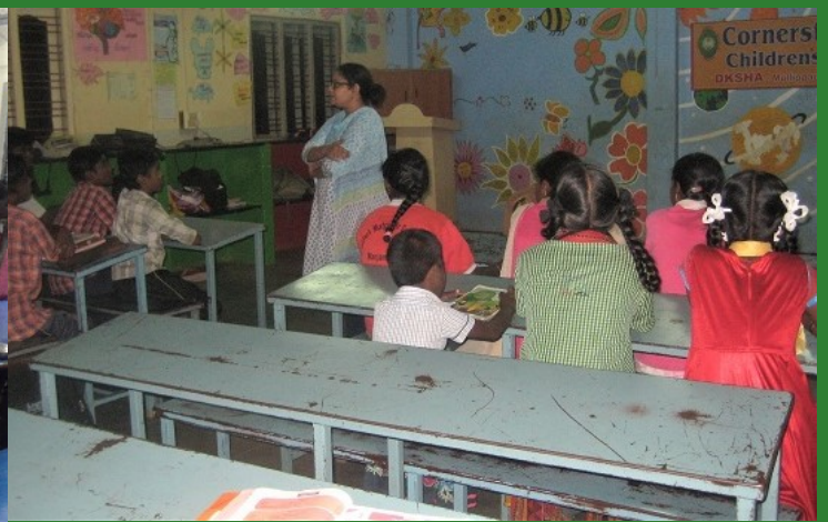
The Miracle Foundation Program Coordinator visited our home and spoke with our children.