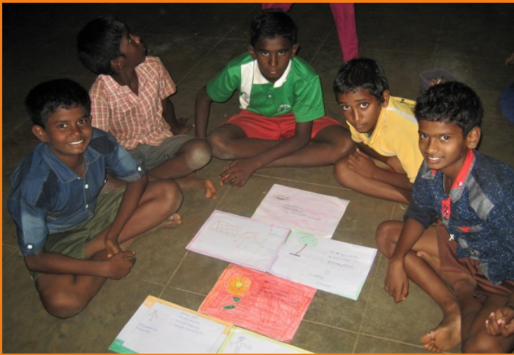
Children write about themselves during a Life Skills Education project.