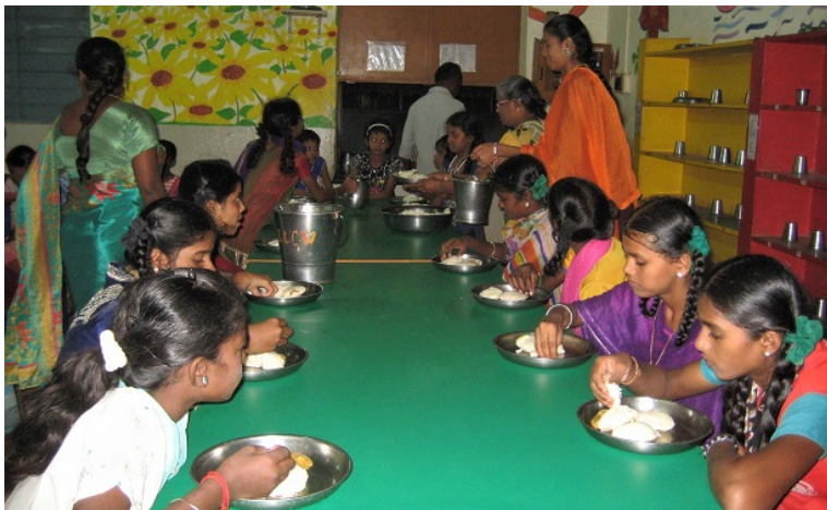
DKSHA Cornerstone Orphanage sincerely thanks ALL donors who sponsored meals for our children!