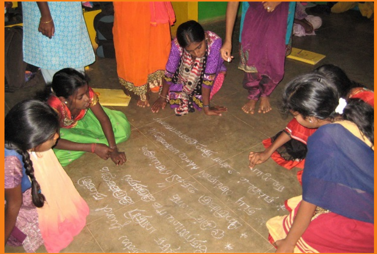
Children write the qualities of a good friend during Life Skills Education.