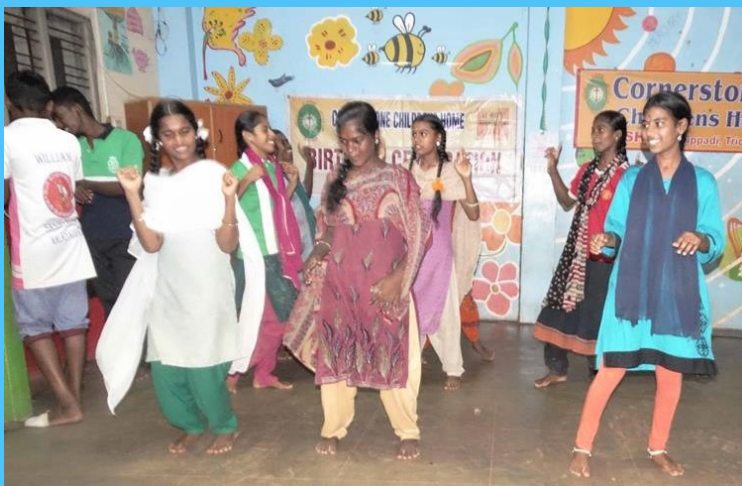
Children dance during the monthly birthday celebration!