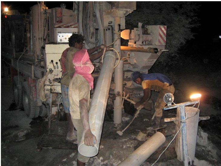
DKSHA drilled a new bore well for the people of Sukkanvali Village with a generous donation received through the Miracle Foundation.