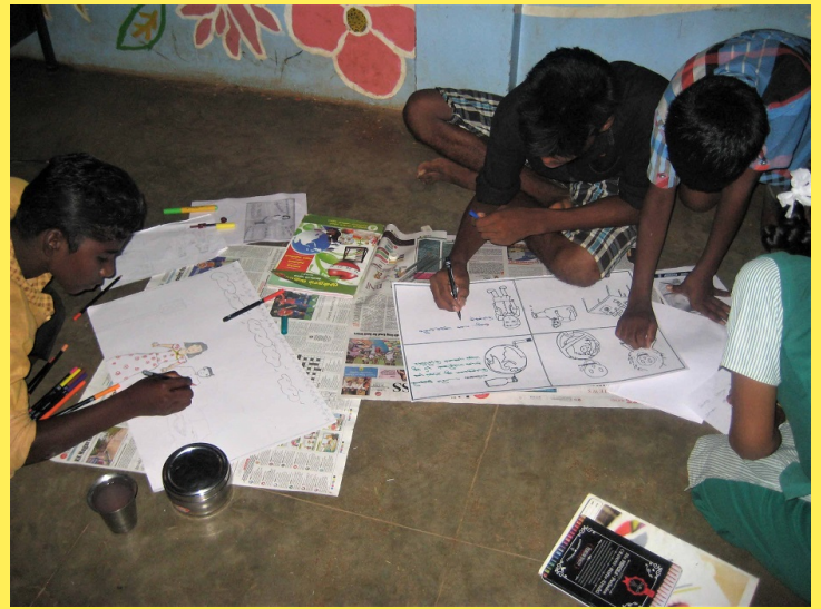
Art competition held on World Mental Health Day