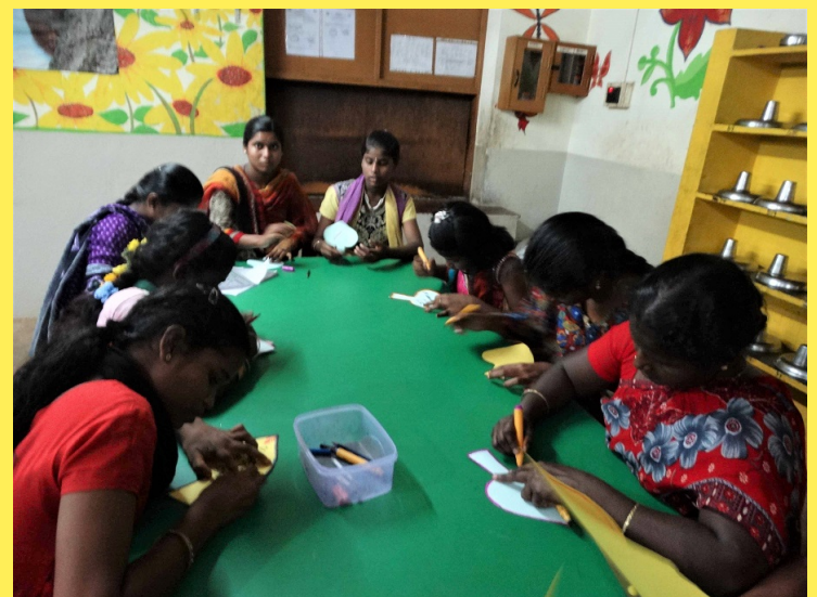
Children take part in a tree building exercise