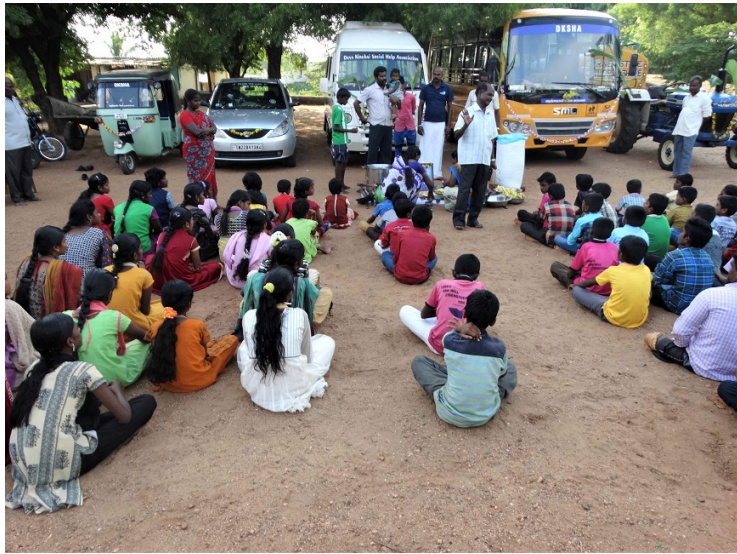
Aayutha Pooja celebrated at DKSHA (Festival of Triumph)