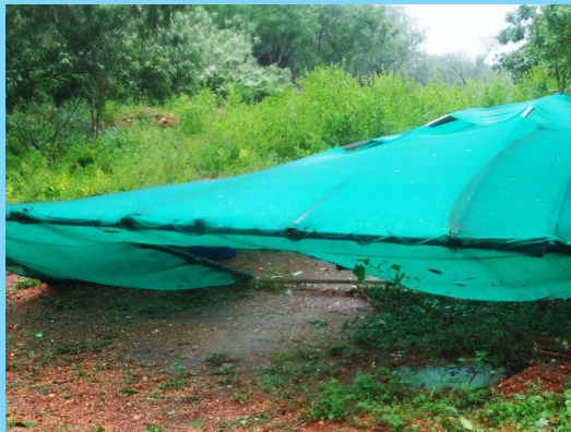
Broken Greenshed at DKSHA