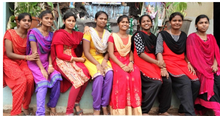
DKSHA Cornerstone College girls at Triple Fest 2018