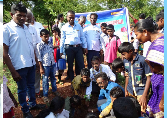
Children with local Rotarians planting trees after Gaja