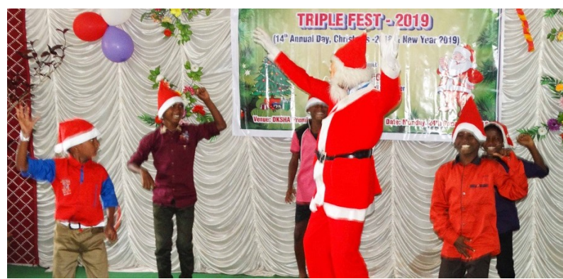
Santa dancing with Cornerstone boys

Everyone at DKSHA had a wonderful, simple Triple Fest 2018 celebration. This celebration combined Christmas 2018, DKSHA Cornerstone's 14th Annual Day, and welcoming in the 2019 New Year!