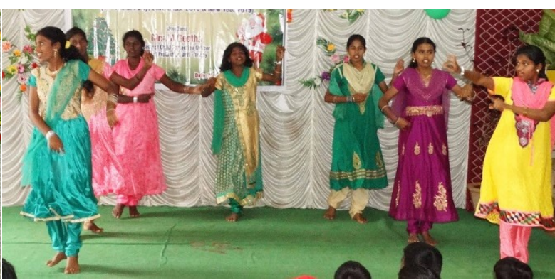
Dance by Cornerstone girls