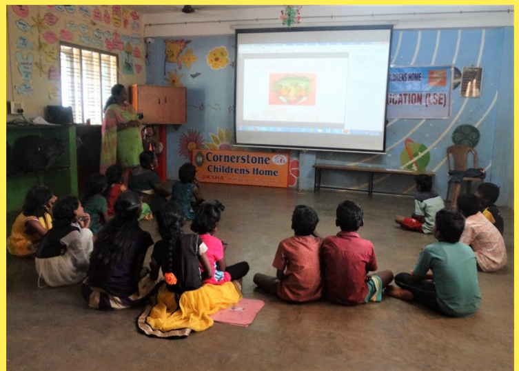
Children participating in Life Skills Education