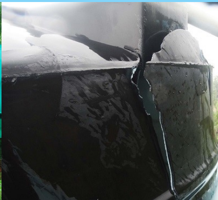
Broken water tank at DKSHA