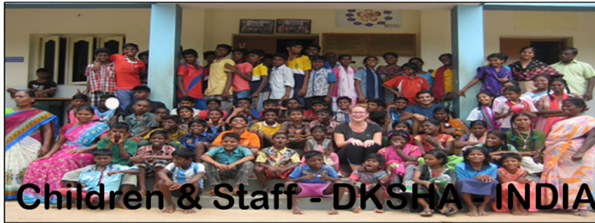
Children & Staff - DKSHA - INDIA

Wishing you a Christmas Season filled with peace and love, and may the coming NEW YEAR - 2019 bring you much fulfilment and prosperity...!