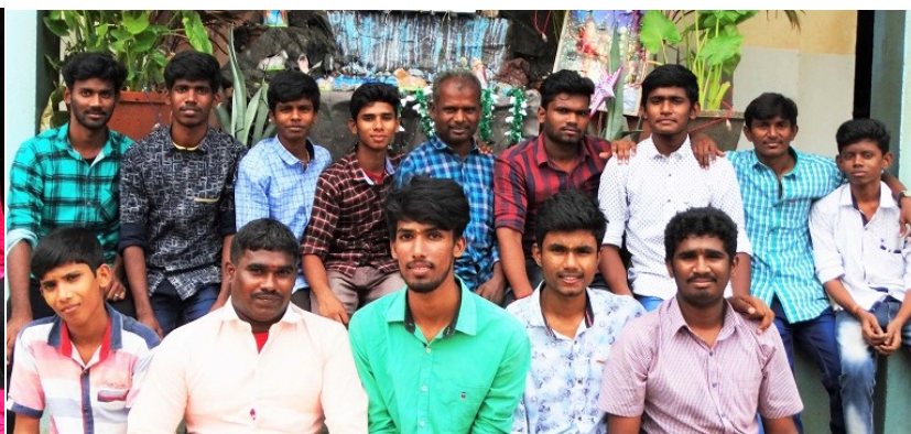
DKSHA Cornerstone College boys at Triple Fest 2018