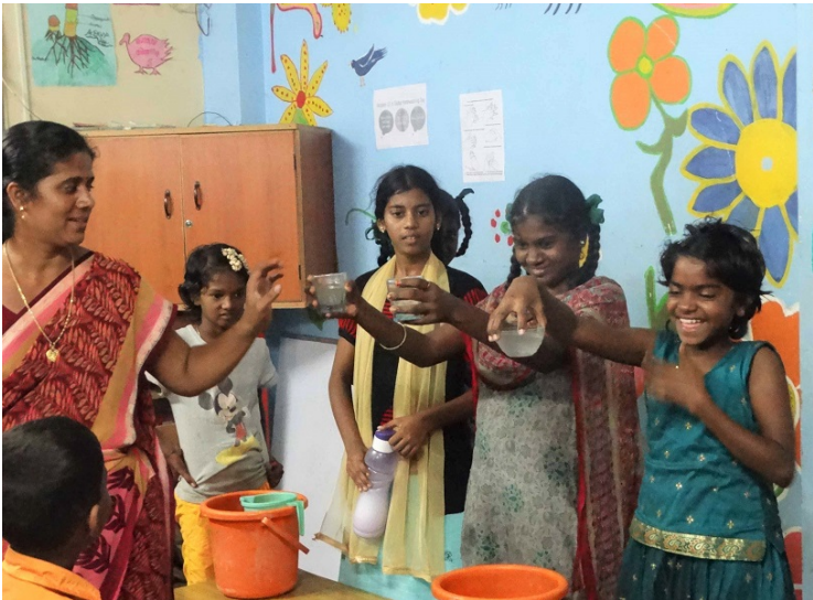
Happy children on hand wash day