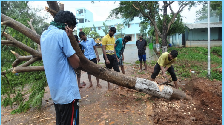
Many trees fell at DKSHA Cornerstone Home including every tree along the front side.